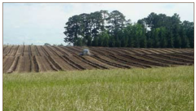
Establishing a new vineyard with Soilco Spreader and GO Compost.