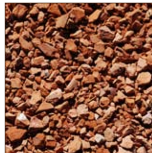
Terracotta Mix - 20mm

Attractive soft red recycled tile - at an economical price. Terracotta Fines have a smaller particle size making the product suitable for use on pathways and driveways. Stabilise with off white cement for added strength.