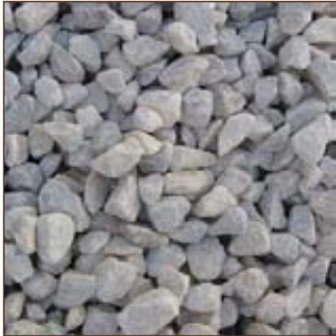
Snow White - 20mm

Snow White provides an economical alternative to other white pebbles. A crushed limestone aggregate that provides a crisp touch to any garden area. The soft white colouring is a contemporary contrast to charcoal or beige pavers and accent foliage. Also available in 10mm.